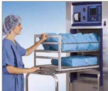
Load car and transfer carriage