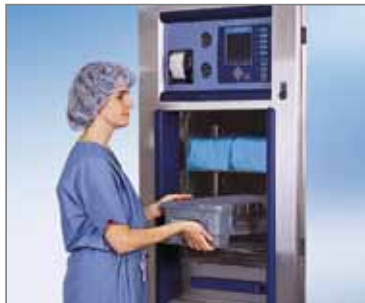
Racks and adjustable shelves